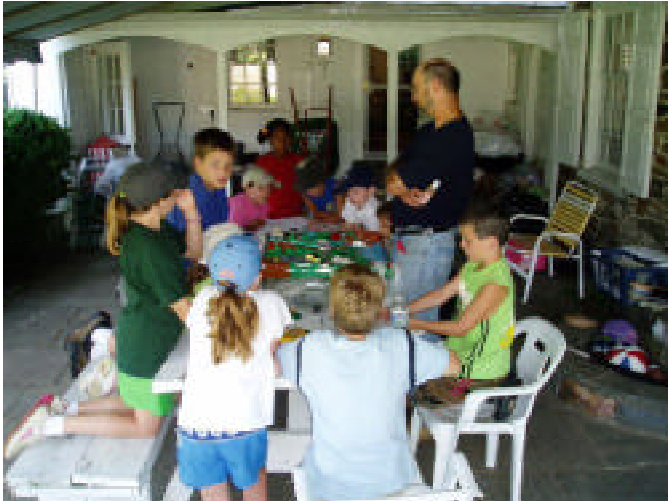
Students at PRC's Environmental Living Demonstration Center learn about watersheds with the help of an Enviroscape.

Pennsylvania's Academic Standards and include engaging age-appropriate activities. Most of the programs can be conducted in the classroom, and others provide outstanding field trip opportunities.