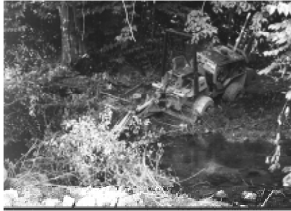
Backhoe left stranded in Little Darby Creek by Adelphia Cablevision leads to investigation of damage to area.

Adelphia was instructed to immediately stabilize the stream banks with